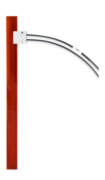
Figure 1 STP01 soil temperature profile sensor is applied in many large scale networks .

STP01 accurately measures the temperature profile of the soil at 5 depths close to its surface. It is used for scientific grade surface energy balance measurements. The sensor is buried and usually cannot be taken to the laboratory for calibration. The on-line self-test using the incorporated heating wire offers a solution to verify STP01's measurement stability.