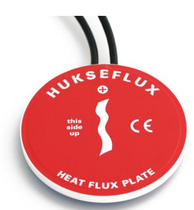
Figure 4 STP01 is often used in combination with HFP01SC self-calibrating heat flux sensor, shown in the picture

Figure 3 IT01 insertion tool is hammered down into the soil. After retracting it leaves a slit in which STP01 may be inserted