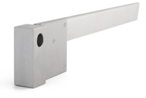
Figure 3 IT01 insertion tool is hammered down into the soil. After retracting it leaves a slit in which STP01 may be inserted

For ease of installation with a minimum of disturbance of the local soil, Hukseflux offers IT01 insertion tool.