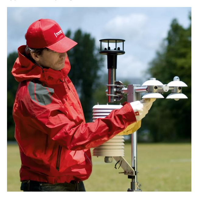
Figure 2 STP01 is often used in meteorological surface energy flux measurement stations