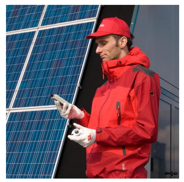
Figure 4 LI19 used with a pyranometer in a field measurement campaign

Figure 3 a graph generated using data stored on LI19