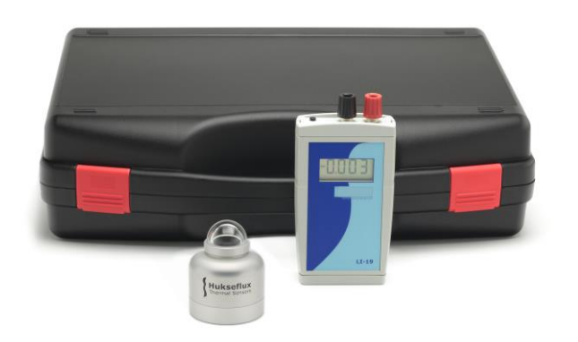
Figure 2 SR05-LI19 as it is delivered, in a practical transport case