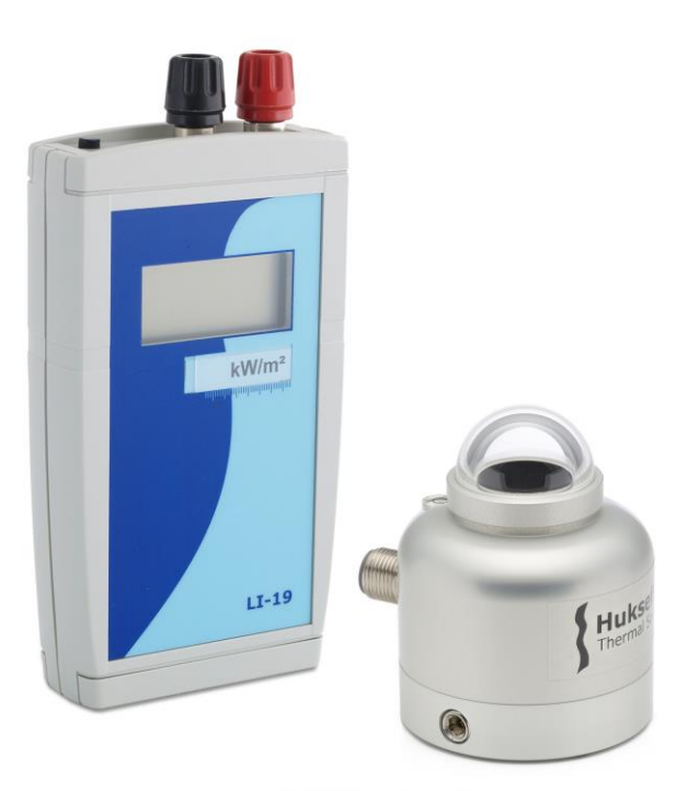
Figure 1 SR05-A1 pyranometer with LI19 handheld read-out unit / datalogger

SR05 is a solar radiation sensor that is applied in most common solar radiation observations. SR05-A1, with analogue millivolt output, complies with the spectrally flat Class C specifications of the ISO 9060 standard and the WMO Guide. LI19 is a high-accuracy handheld read-out unit / datalogger. The SR05-LI19 combination is well suited for mobile measurements and short term datalogging.