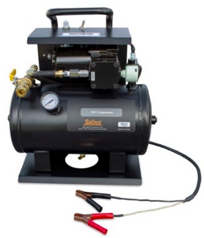
12 Volt Compressor

The compressor operates using 12 volt DC power source, such as a car or truck vehicle battery, and comes with alligator clips. The compressor operates at up to 150 psi and is equipped with a 2 US gallon (7.6 L) air tank which is rated to 175 psi.