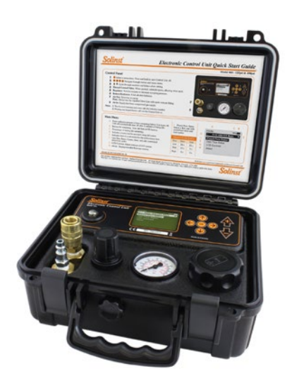
Model 464 Electronic Control Unit (125 psi and 250 psi Models)

The pump is quick to disassemble and the bladders and screens are simple to replace in the field. No tools required. Inexpensive polyethylene bladders can be quickly replaced to suit regulatory requirements.