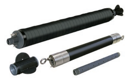
Model 800 Packers 3.9" and 1.8" (99 mm and 46 mm)

Model 800 Low-Pressure Packers can be used with Solinst Bladder Pumps to minimize purge times by reducing purge volumes. This reduces the cost of water disposal and labour. Packers are available in single point or straddle packer designs, and in sizes to fit 2'' (50 mm) to 5'' (127 mm) dia. wells. (See Model 800 Data Sheet.)