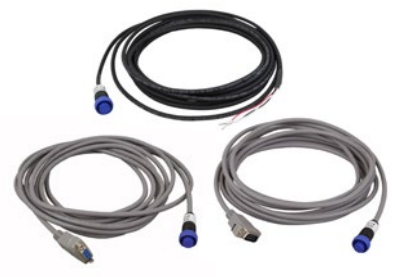
Connector Cables for Communicating using SDI-12 and MODBUS RS-232/RS-485 Protocols